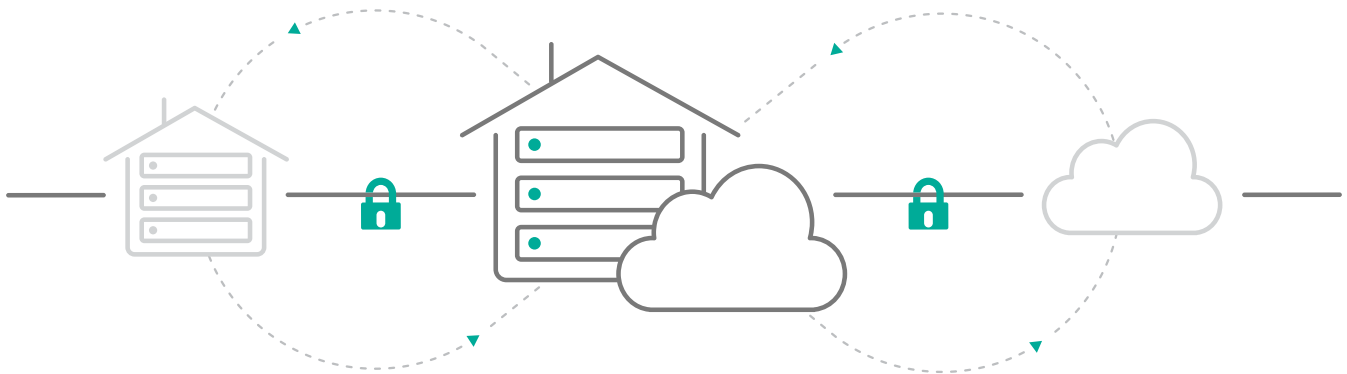
Hybrid BI Deployment: On-premise and cloud data pass through a secure firewall combining with other (on premise or cloud) data sources

We have identified the following list of seven fundamental considerations to ensure your hybrid BI deployment is based on sound business rationale and has the best chance of success. As hybrid BI is not one-size-fits-all, this list is not exhaustive. Rather, it is designed to provide a solid foundation on which to build a hybrid BI strategy that will help achieve your business objectives.